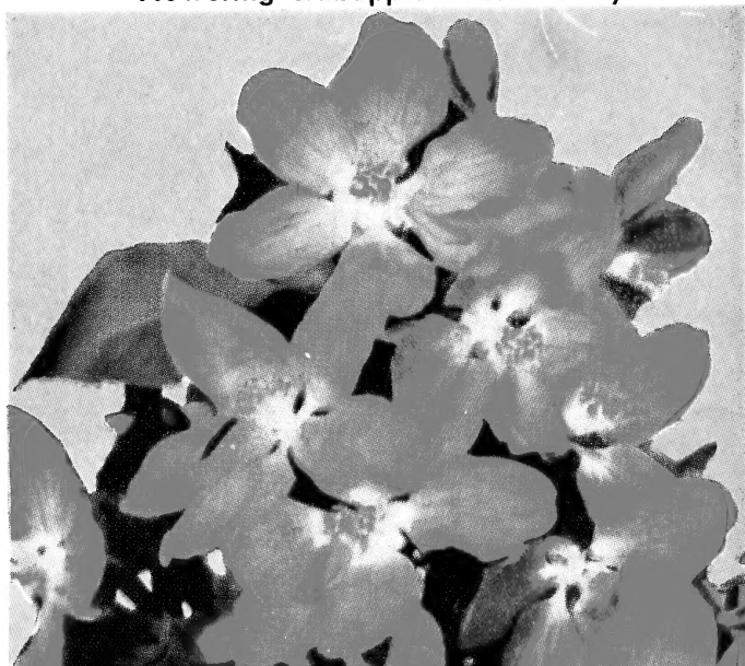
Flowering Crabapple Malus Almey